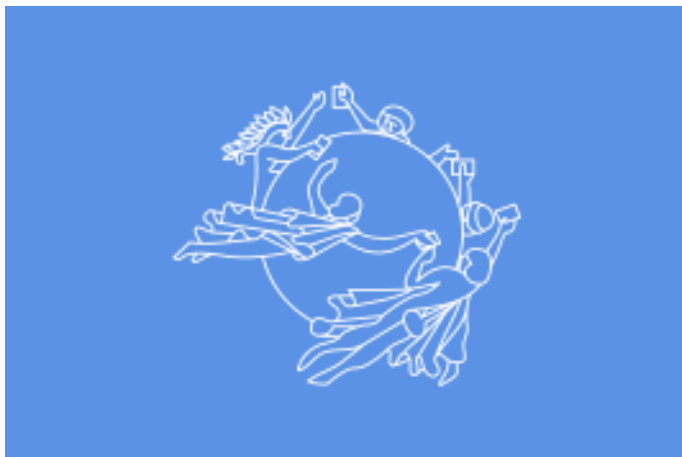
The Universal Postal Union Flag

examine proposals to amend the Acts of the UPU, including the UPU Constitution, General Regulations, Convention and Postal Payment Services Agreement. The Congress also serves as forum for participating member countries to discuss a broad range of issues impacting international postal services, such as market trends, regulation and other strategic issues. The first UPU Congress was held in Bern, Switzerland in 1874. Delegates from 22 countries participated. UPU Congresses are held every four years and delegates often receive special philatelic albums produced by member countries covering the period since the previous Congress.