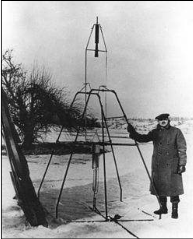
Robert Goddard, bundled against the cold New England weather of March 16, 1926, holds the launching frame of his most notable invention — the first liquid-fueled rocket.

On October 5, 1882, Robert Goddard was born in Worcester, Massachusetts. Early in life, young Robert suffered from pulmonary tuberculosis which kept him out of school for long periods of time. However, he kept up with his studies and was an avid reader, devouring popular science fiction novels. In fact, it was after reading H.G. Wells' "The War of the Worlds" that he first became interested in space exploration.