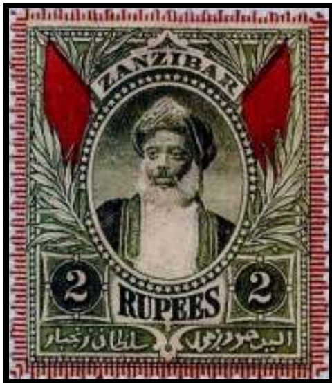
Sultan Seyyid Hamoud-bin-Mohammed-bin-Said, Scott 62 - 78, issued 1899 to 1901.

Produced by De La Rue, the first definitive series comprised ten low values from ½a to 8a and five larger-format high values from 1r to 5r. They were quite magnificent and unusual, recess-printed in a range of colours but with the distinctive draped red flags of Zanzibar added by letterpress.