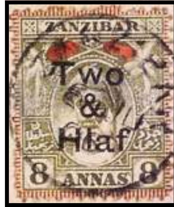
The 'Two & Hlaf' error, Scott 98a. Issued in 1904.

The Anglo-Zanzibar War had been the shortest war in history, all over in 38 minutes. And it insured that when a fine second issue of stamps appeared in June 1899, to the same unconventional design as the first, it was Sultan Hamoud whose portrait they bore.