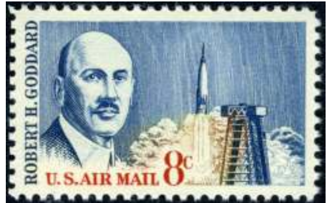
Robert H. Goddard, Scott C69, issued October 5, 1964.

That year, he began teaching physics at Clark University in Worcester. His thoughts on space flight started to emerge in 1915, when he theorized that a rocket would work in a vacuum, and didn't need to push against air in order to fly. This meant that in the vacuum of space, rocket engines would be able to produce thrust. At his own expense, he began to make systematic studies about propulsion provided by various types of gunpowder. He began experiments on the efficiency of rockets. He bought some commercial rockets and measured their thrust using a ballistic pendulum, a heavy mass suspended by ropes, to which the rocket was attached. The rocket was fired, and the height to which the pendulum rose provided a measure of the total momentum (mass times velocity) imparted to it. Goddard also used an equivalent set-up, where the mass pushed against a spring, instead of being suspended.