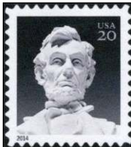
Advance artwork for the new Lincoln stamp to be issued 2014.