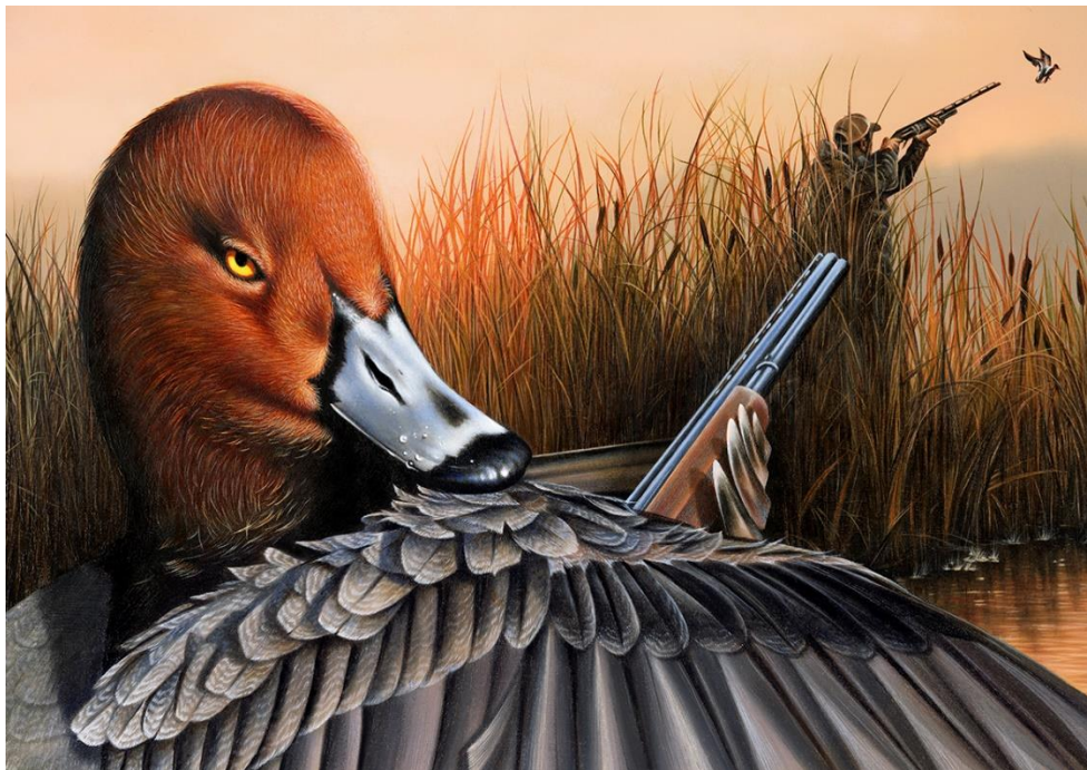
Duck Hunting Hunters Sold for $16,100