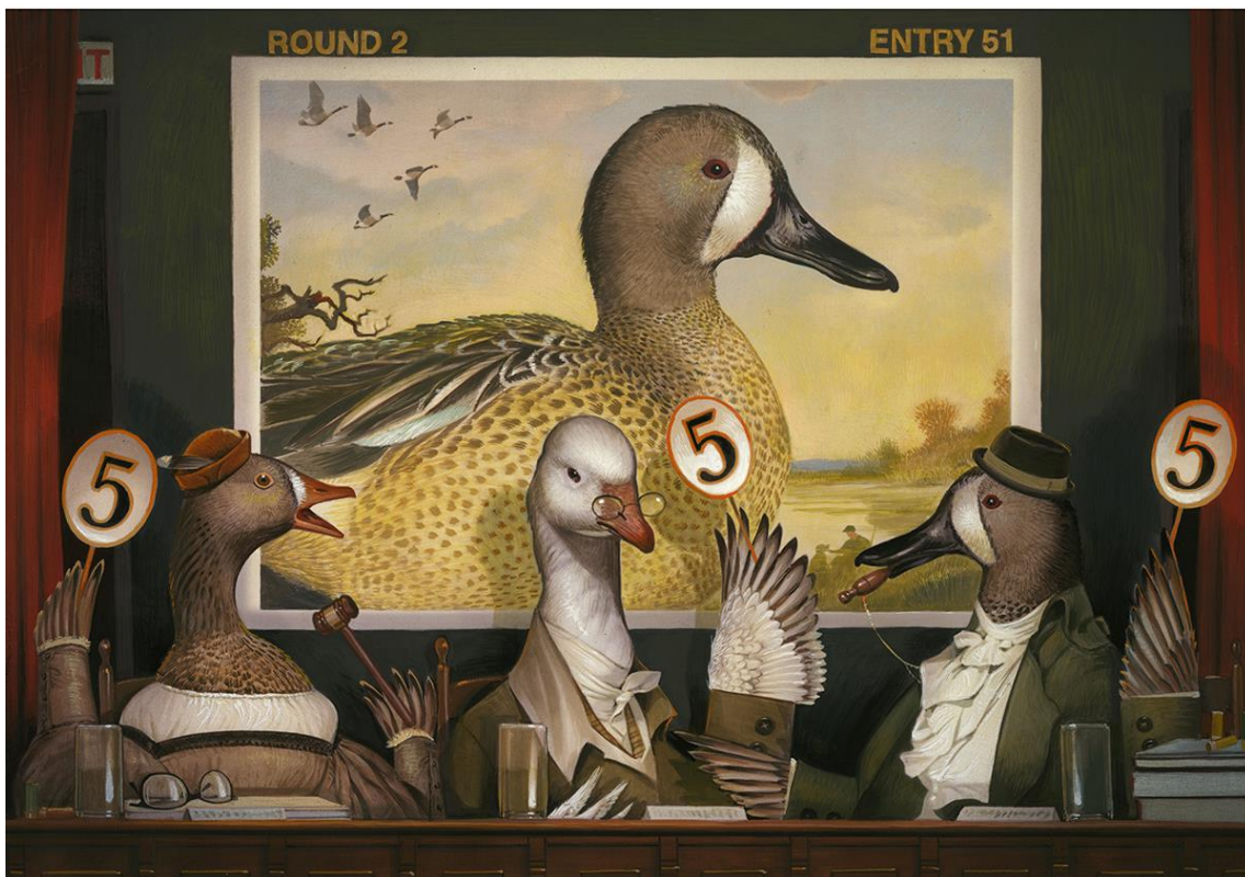
Duck Judges Sold for $25,250

These paintings were entered in the 2021 Federal Duck Stamp Art Contest. Sadly, these paintings were rejected from the competition for a variety of rule violations. Therefore, they were put up for auction on eBay. All proceeds benefit the U.S. Fish and Wildlife Service's Federal Duck Stamp Program to protect wetland habitat in our National Wildlife Refuge System.