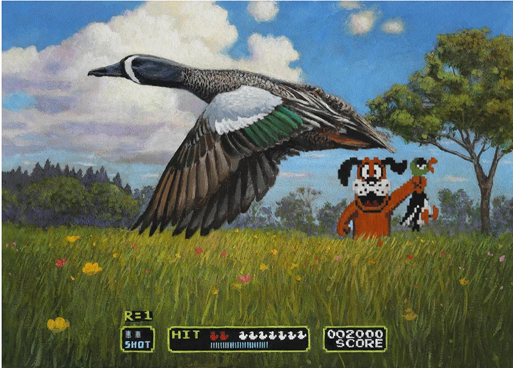
Duck Hunt Sold for $32,200