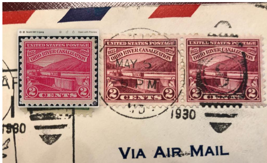
Close up of the pair of 681As on cover with 681 in normal carmine rose shade superimposed to show color difference.