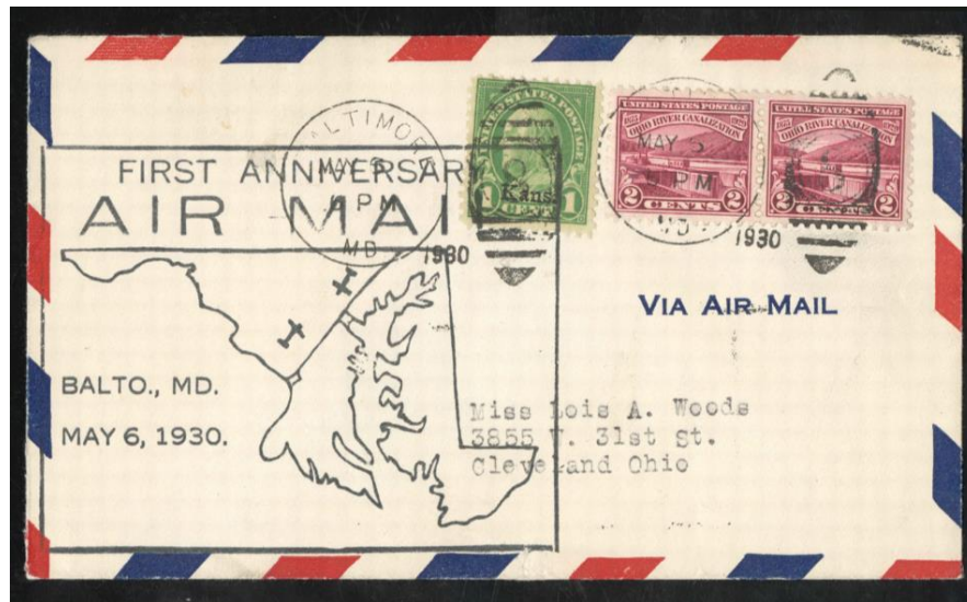
The 681A flight cover

PS: If you can shed any light on this intriguing cover, please contact me directly at RBprodx@comcast.net . Thank you.